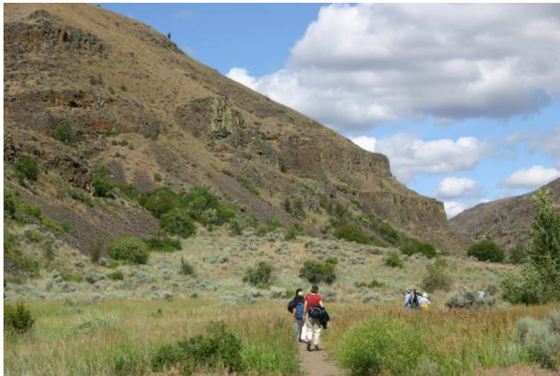
Seeking serenity in the Umtanum Canyon's shrub-steppe -- photo by Ellen Stepniewski