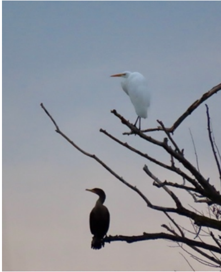
Great Egret and Double-crested Cormorant