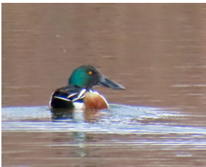
Northern Shoveler