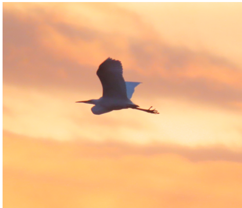
Great Egret