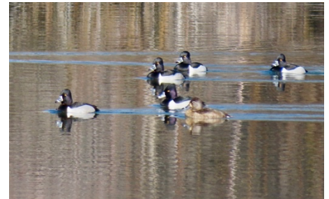
Ring-necked Ducks, photo S. Shippen