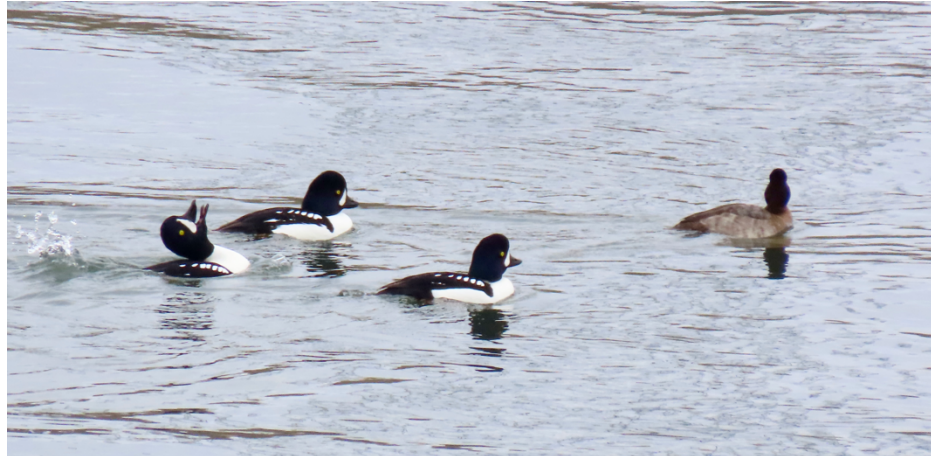
Barrow's Goldeneye display

Contact Bill Drenguis, bdrenguis@gmail.com or text 509 731 8632 to sign up.