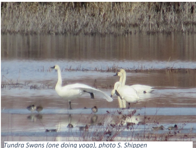
Tundra Swans (one doing yoga)