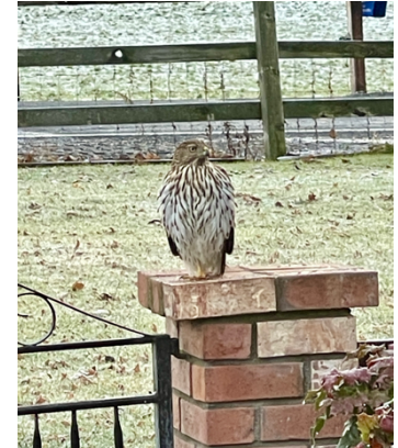
Juvenile Sharp-shinned Hawk watching feeder

The Great Backyard Bird Count (GBBC) is a free, fun, and easy event that engages bird watchers of all ages in counting birds to create a real-time snapshot of bird populations. Participants are asked to count birds for as little as 15 minutes (or as long as they wish) on one or more days of the four-day event and report their sightings online at birdcount.org . Anyone can take part in the Great Backyard Bird Count, from beginning bird watchers to experts, and you can participate from your backyard, or anywhere in the world. Click here for more information: birdcount.org and become a citizen scientist!