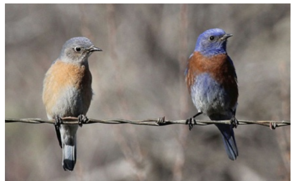
Pair of Western Bluebirds