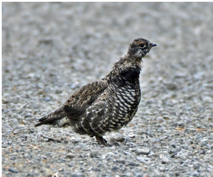
The Canada jay and spruce grouse turned out to be a life birds for one of the lucky birders.