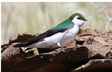
Violet-green Swallow