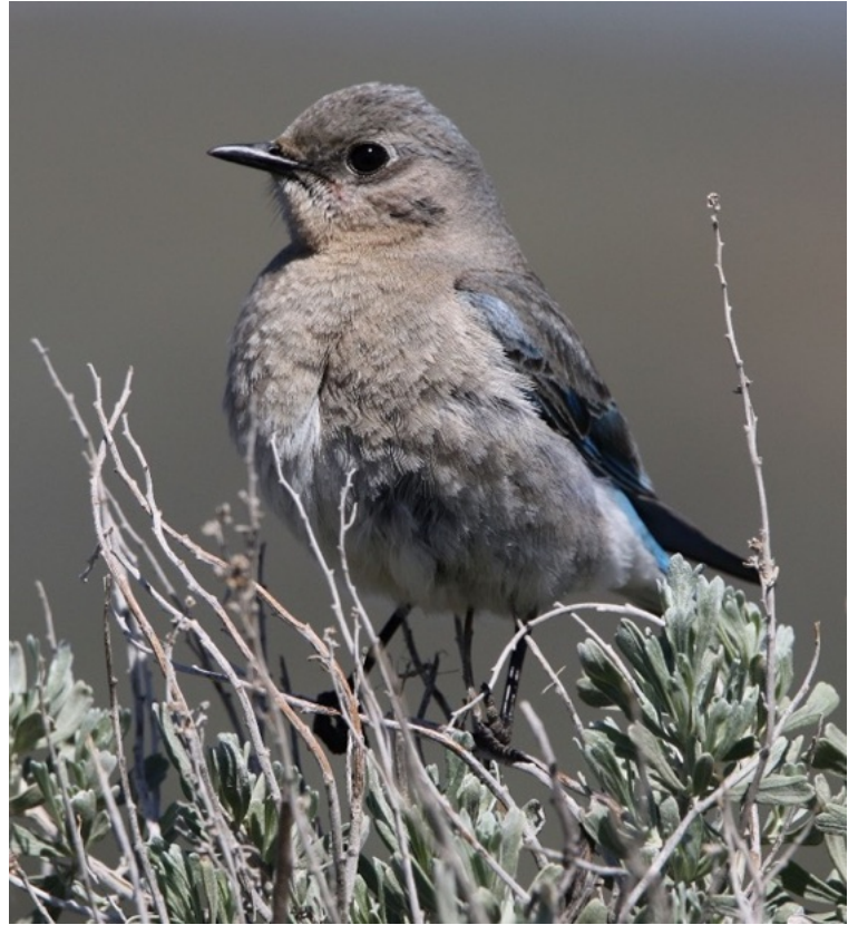
Female Mountain Bluebird

To pay online go to the YVAS website: https://yakimaudubon.org/