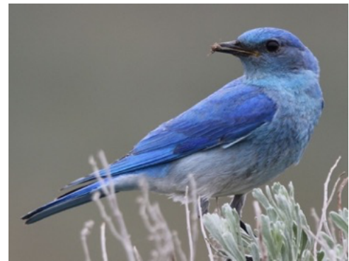
Male Mountain Bluebird, photo by Karen Zook

Yakima Area Arboretum 1401 Arboretum Drive