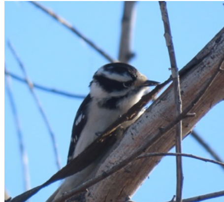
Female Downy Woodpecker

Twelve members attended the Second Saturday Bird Walk on March 8 and were rewarded with one of the nicest days of 2023! It was clear, calm, and sunny at 9:00 AM and after a cool night, the birds were just starting to forage. The Poppoff Trail meanders along and around three ponds adjacent to the Yakima River. It passes through a variety of excellent bird habitats along the ponds, the Yakima River, and wooded areas. Our walk finished at Billy’s Pond. The pond was created as run-off from the water treatment plan and a place where birds congregate when most local ponds are still frozen.