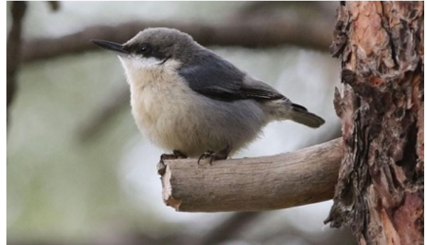
Pygmy Nuthatch on Vredenburg Trail