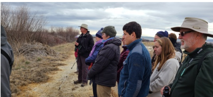
Waiting for the Rail

cattails. Swallows of various species should have arrived, flitting low over the water hawking insects. We'll walk 1.5-2 miles on a dike track encircling the ponds on the lookout for other birds like Yellow-headed Blackbird. Raptors should be about, too. Expect to be homeward bound by about noon or so. Dress for the weather and bring footwear you don't mind getting a little muddy. Contact Andy Stepniewski at steppie@nwinfo.net to sign-up and receive more details and meeting location.