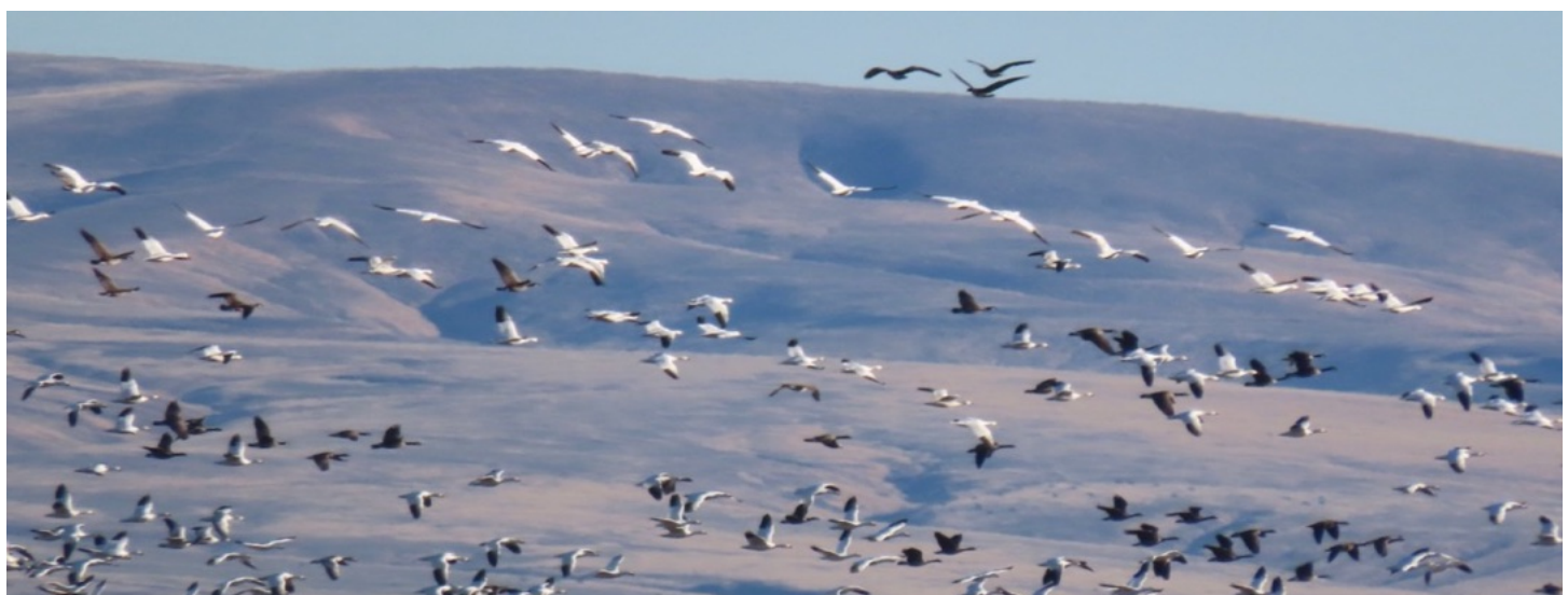
Snow and Canada Geese over Toppenish