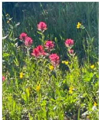
Magenta Paintbrush at Chinook Pass