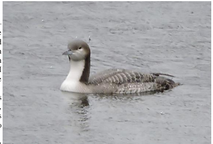
Pacific Loon found on Dog Lake

The feeding station at the Yakima Area Arboretum is up and running and is attracting some interesting birds. A Red Fox Sparrow, the subspecies of Fox Sparrow that nests in the Eastern United States