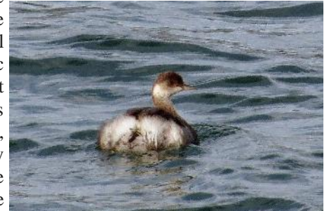
Eared Grebe