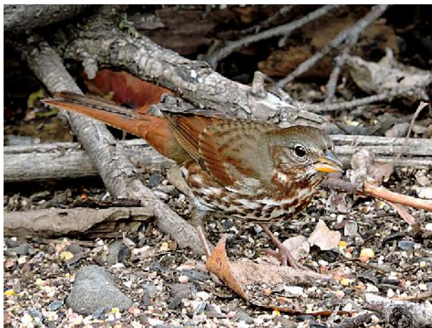
Red Fox Sparrow at the Yakima Area Arboretum

and Canada, was seen and photographed there on Oct. 21. This subspecies of Fox Sparrow is a fairly rare bird in Washington. It is also the most colorful of the Fox Sparrow subspecies.