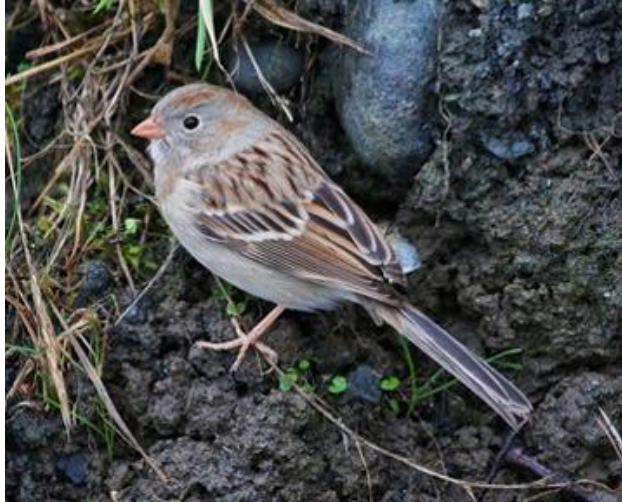
First Field Sparrow seen in Washington