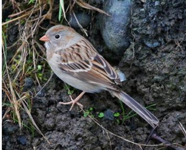
First Field Sparrow seen in Washington