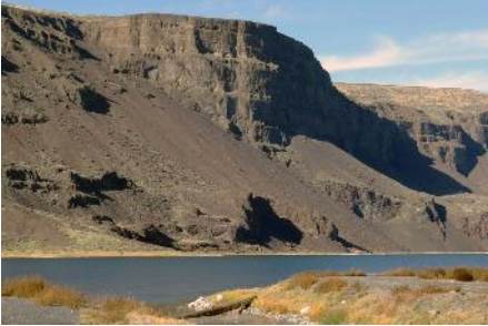
Lake Lenore

flock of 32 Wild Turkeys and 2 female White-tailed Deer mingling with 4 female Mule Deer. We next stopped at Tjossem Pond in Ellensburg where I had seen an immature Snow Goose on Friday, no Snow Goose was present but we did see a Red-necked Grebe. A stop at Vantage proved mostly uneventful, with a few grebes, a Common Loon and some scattered waterfowl. Soap Lake was next, and this spot is well known for concentrations of Ruddy Duck and Eared Grebe in the alkaline waters of the lake. Good numbers of both species were observed by all and some photo opportunities of Eared Grebes were had.