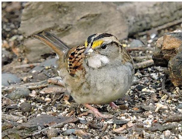
White-throated Sparrow at the Yakima Area Arboretum