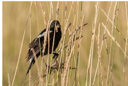
Bobolink